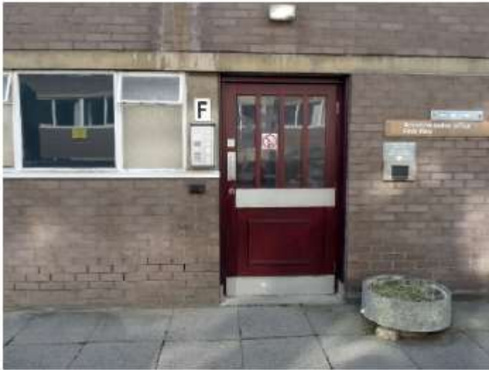
Accommodation office - Entrance "F"